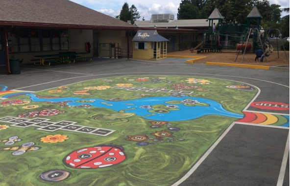
Springer Playground, before and after

The success of the kindergarten blacktop mural enabled Christy to gather support (and donations) from the school community to paint a larger mural at the center of school on the back of the multi-purpose wall a year later. The 40' long peaked and windowless wall faced the center of campus where students lined up for class and had their Friday morning assembly. We chose a landscape as the subject of the mural, a scene that celebrates the local natural habitat to bring the feeling of an expansive nature preserve. We incorporated a legend on the side of the landscape mural to identify species the fourth graders learned